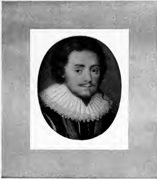
FREDERICK, KING OF BOHEMIA BY ISAAC OLIVER